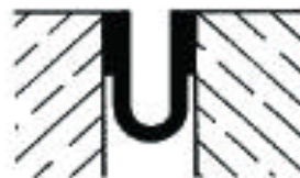
joint bridging with a loop, allowing wide joint movements.