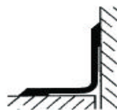
forming of a corner joint