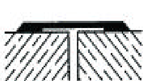
bridging of joint (even)